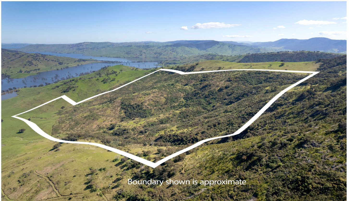
Boundary shown is approximate