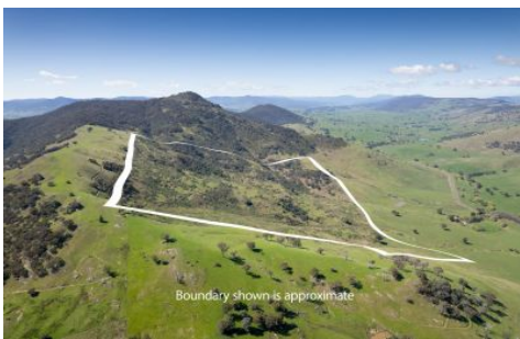
Boundary shown is approximate