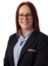
Kiley Law 0260 561 888

For investors, currently leased for $185 per week until October 2022 to an excellent tenant, or can be purchased with vacant possession. Future potential to earn $195 - $215 per week in rental income, after the current lease expires.