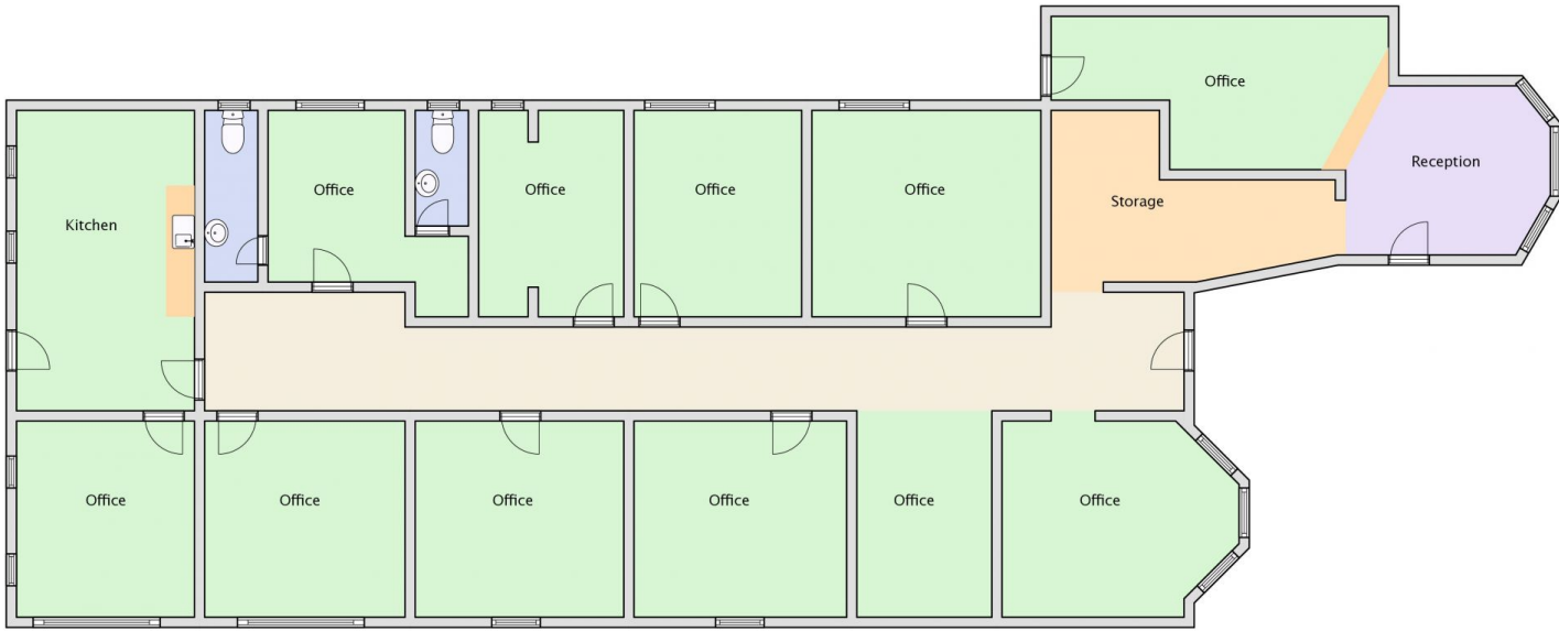
12 Stanley St, Wodonga