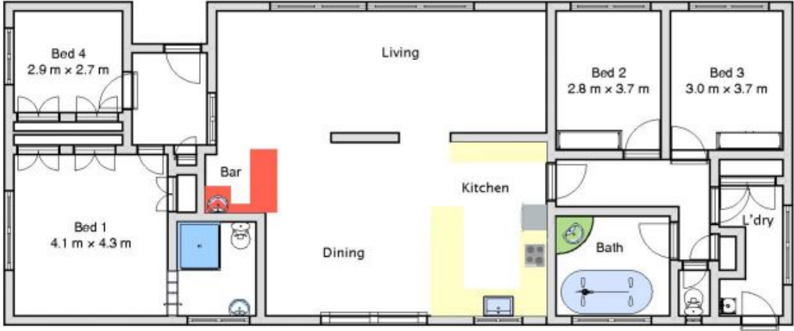
30 Acacia Crescent, Wodonga