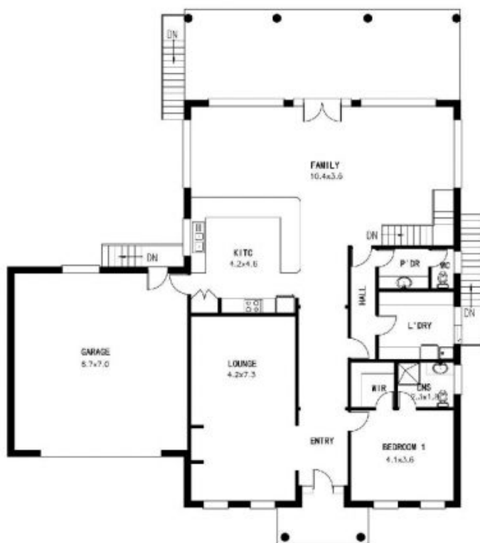
UPPER STOREY FLOOR PLAN