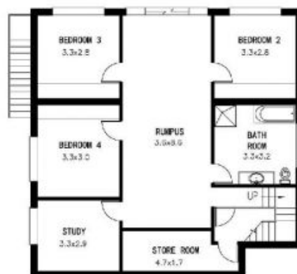
LOWER STOREY FLOOR PLAN